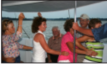
Conga Line on the Pau Hana

We set sail from a tropical port for a three-hour tour, just like the crew and passengers of the S.S. Minnow did a long time ago. But instead of going to Gilligan's Island we sailed by Daufauskie Island and returned safely after enjoying some good food, great friends and a wonderful sea breeze that gave us a well deserved break from the August sun.