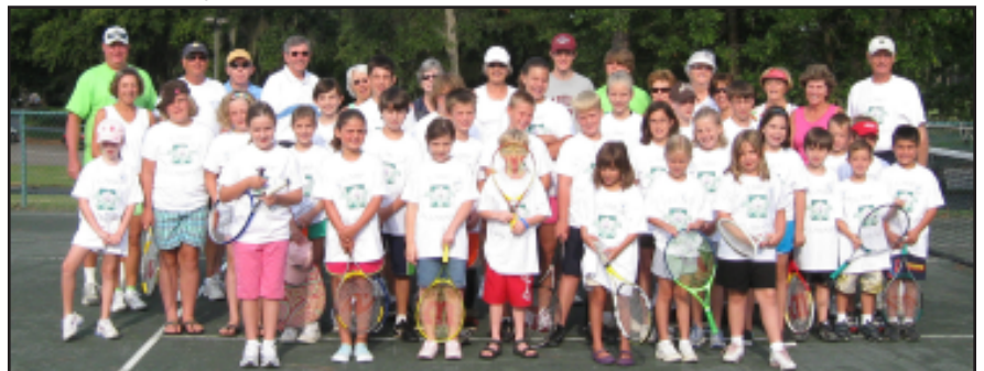
2008 Camp Callawassie